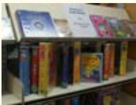
At a library