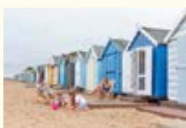
At the beach