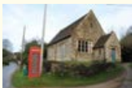
In a village hall