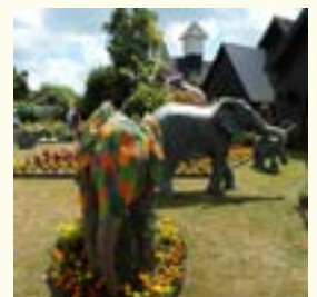
At a farm or zoo