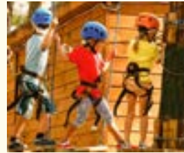
At an outdoor centre