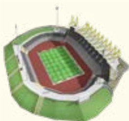
At a sports club