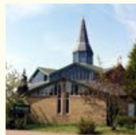
At a place of worship