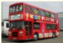
On a mobile bus