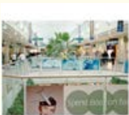
At a shopping centre