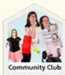
At a Short Breaks hall