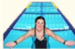
At a swimming pool