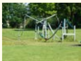
At a park