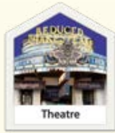
At a theatre