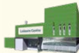
At a leisure centre