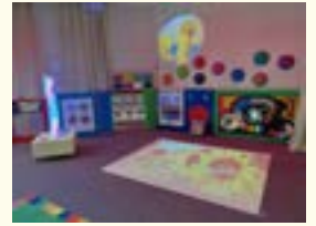
At a children's centre