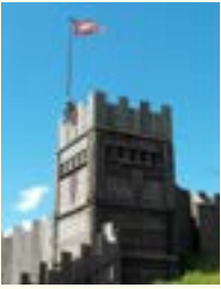
At a historic site

Please tell us where you would like clubs and activities to take place. Tick all that apply.