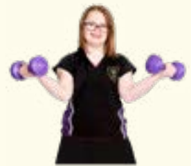
At a gym