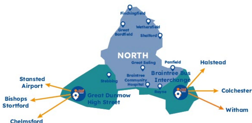
Figure 1: DigiGo North Zone - Current

The North zone has been in operation since July 2024. The current zone boundary is shown below: