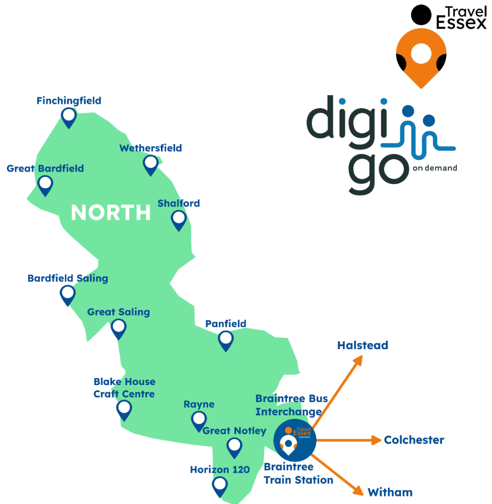
Figure 2: DigiGo North Zone - Proposed

This change would result in direct journeys from the revised zone to the Dunmow/Stebbing area are no longer being possible. These journeys instead could be undertaken via Braintree Bus Interchange. It would also result in the area shown below not being served by DigiGo, affecting 14 addresses.