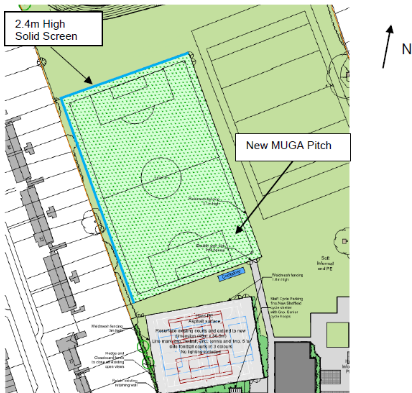
Figure 1: Proposed Screen for MUGA Pitch

A revised Noise Impact Assessment has been carried out. AAD's Addendum Report (which should be read in full in conjunction with this letter) demonstrated that the noise impact of the MUGA with the proposed acoustic screening should be 'none/not significant'. This is illustrated in the summary table from the Report: