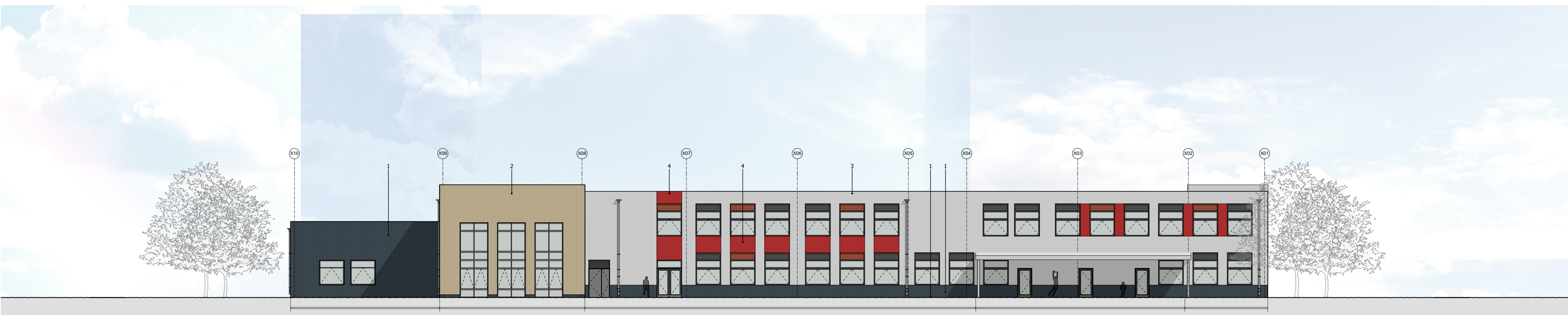
North Elevation 1:200