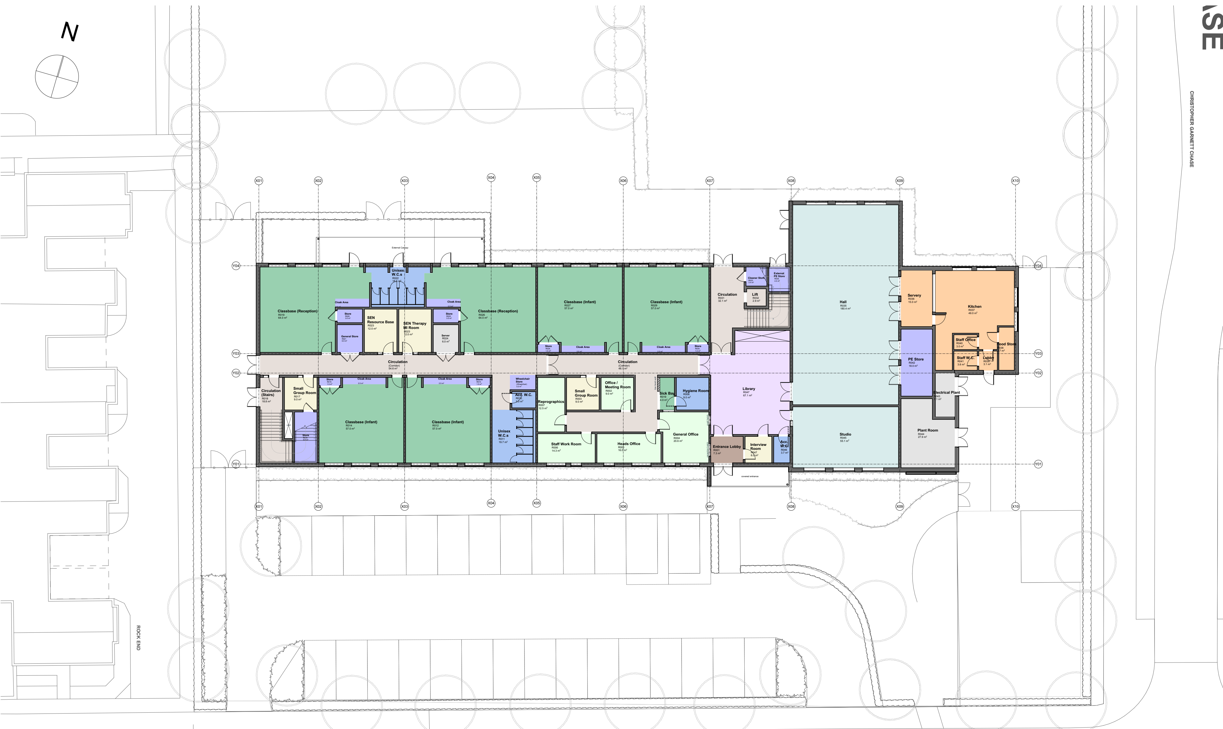
Ground Floor Plan 1:200