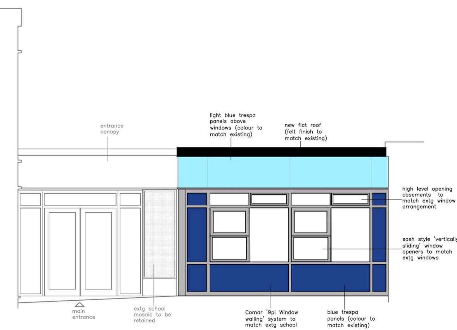
section b-b / west elevation