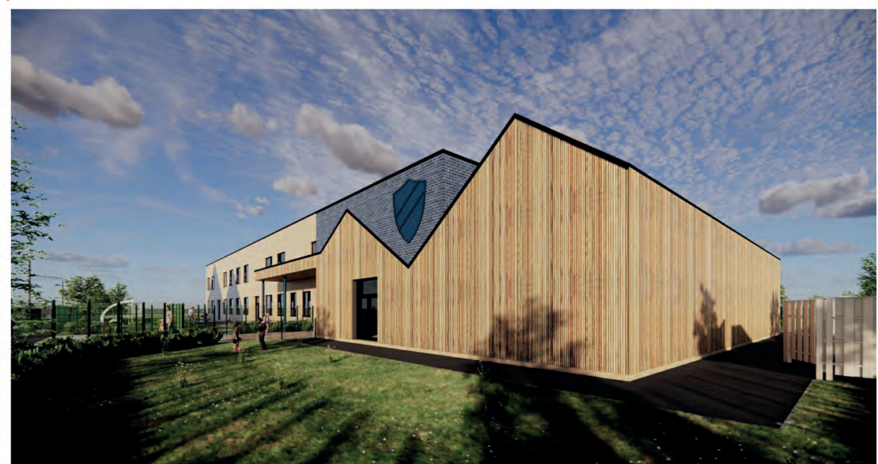
Proposed North Facing View