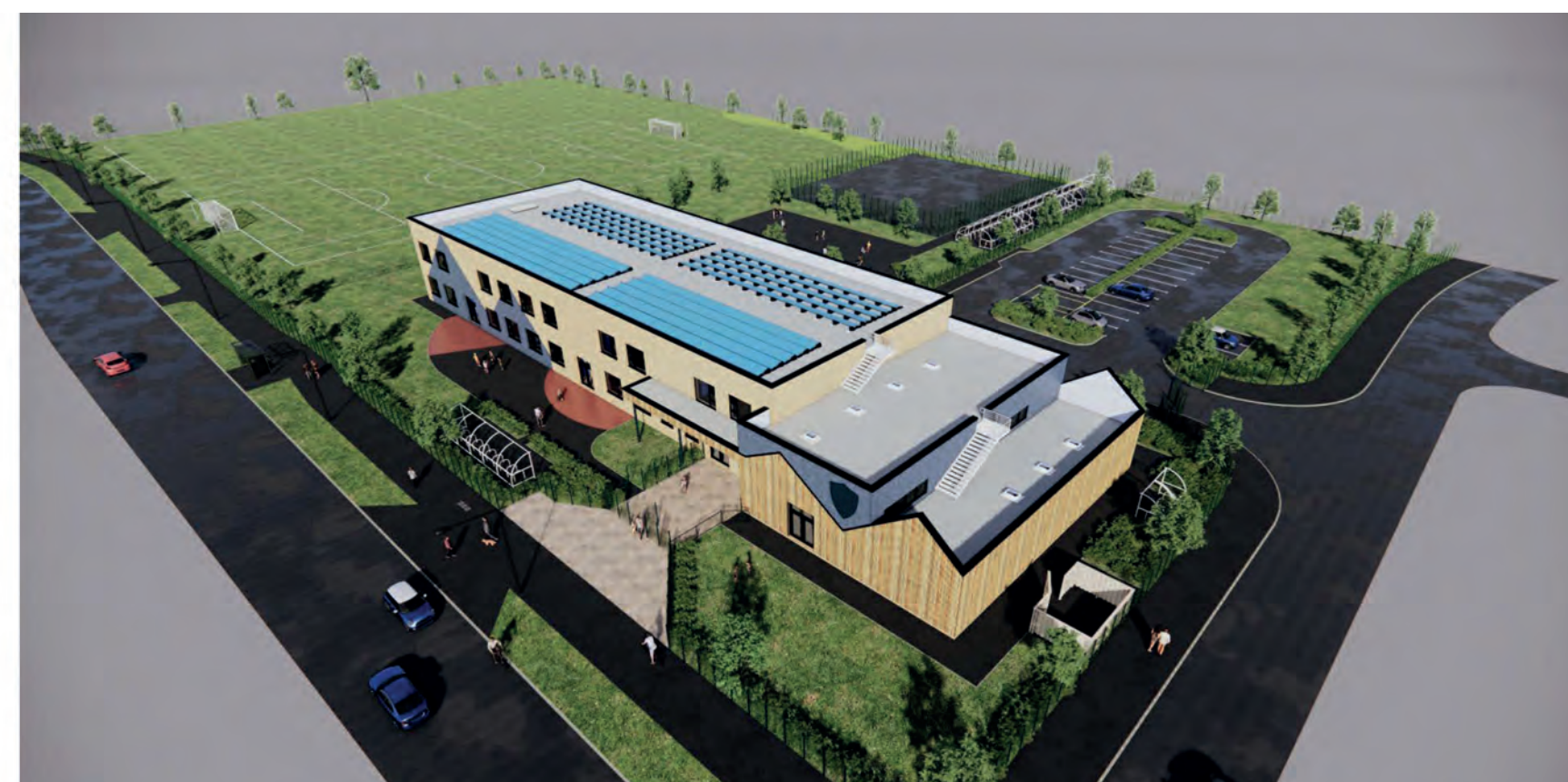
Proposed North Birds Eye View