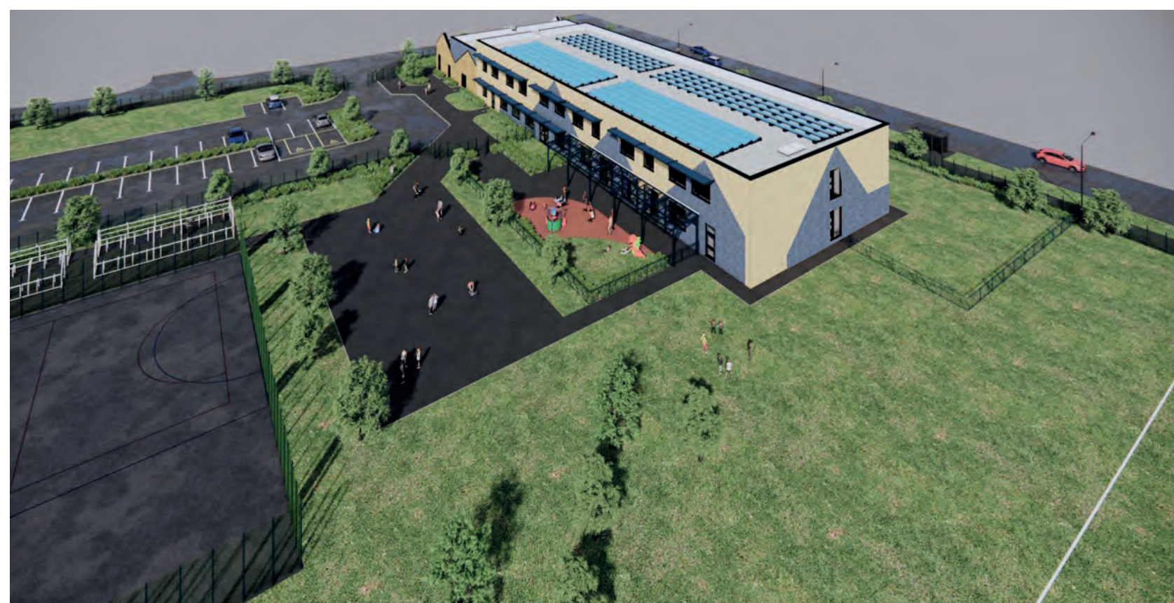
Proposed East Birds Eye View