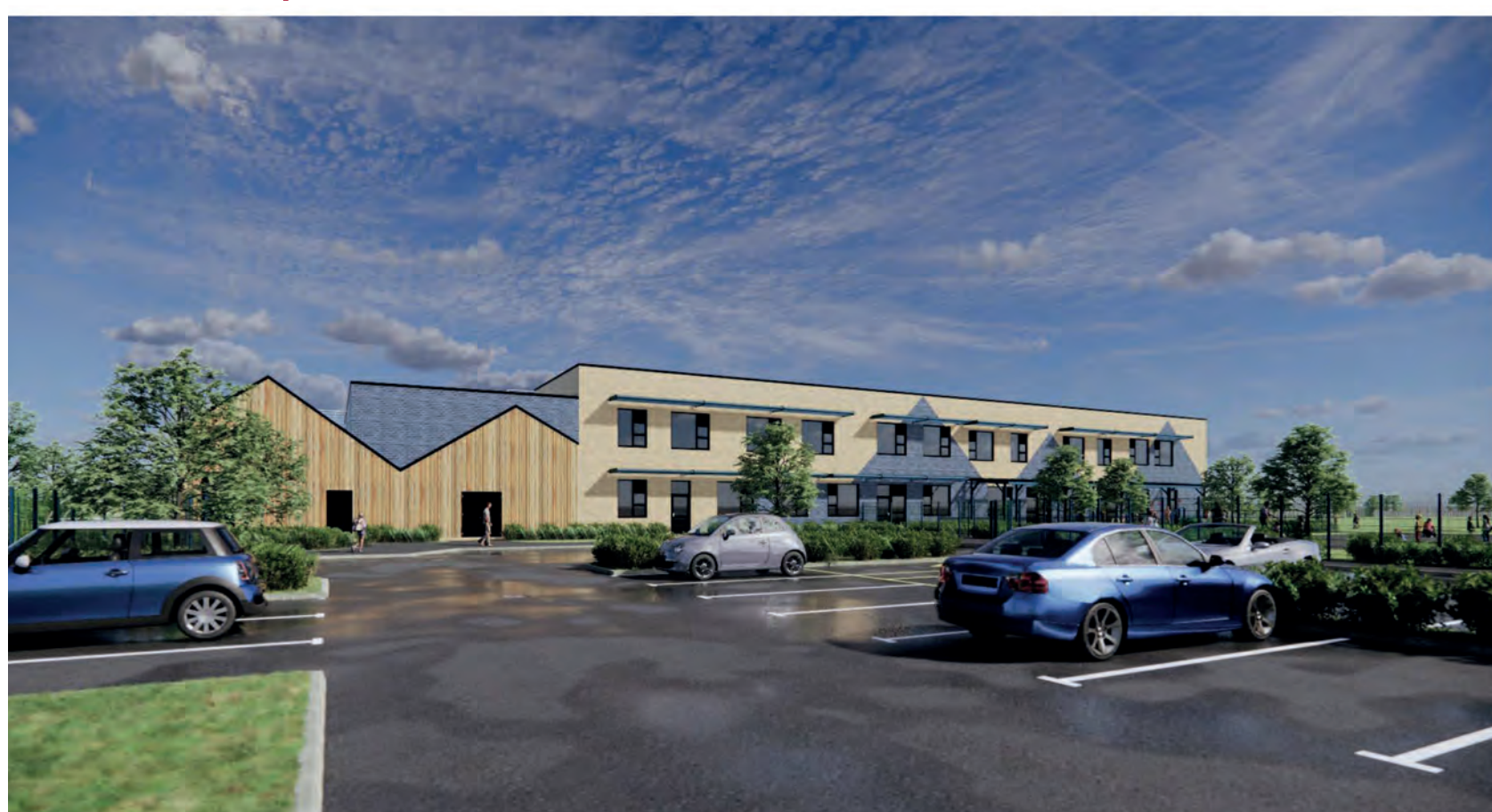
Proposed West Facing View